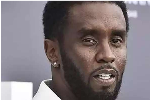
Sean 'Diddy' Combs accused of savage beatings and rape