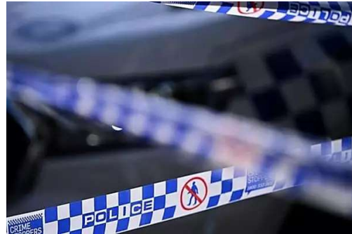
Tragic toll rises as two die in motorhome, truck crash